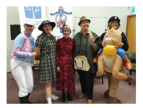
Guests dressed up in celebration of the launch of 'Ride Like a Girl' movie night